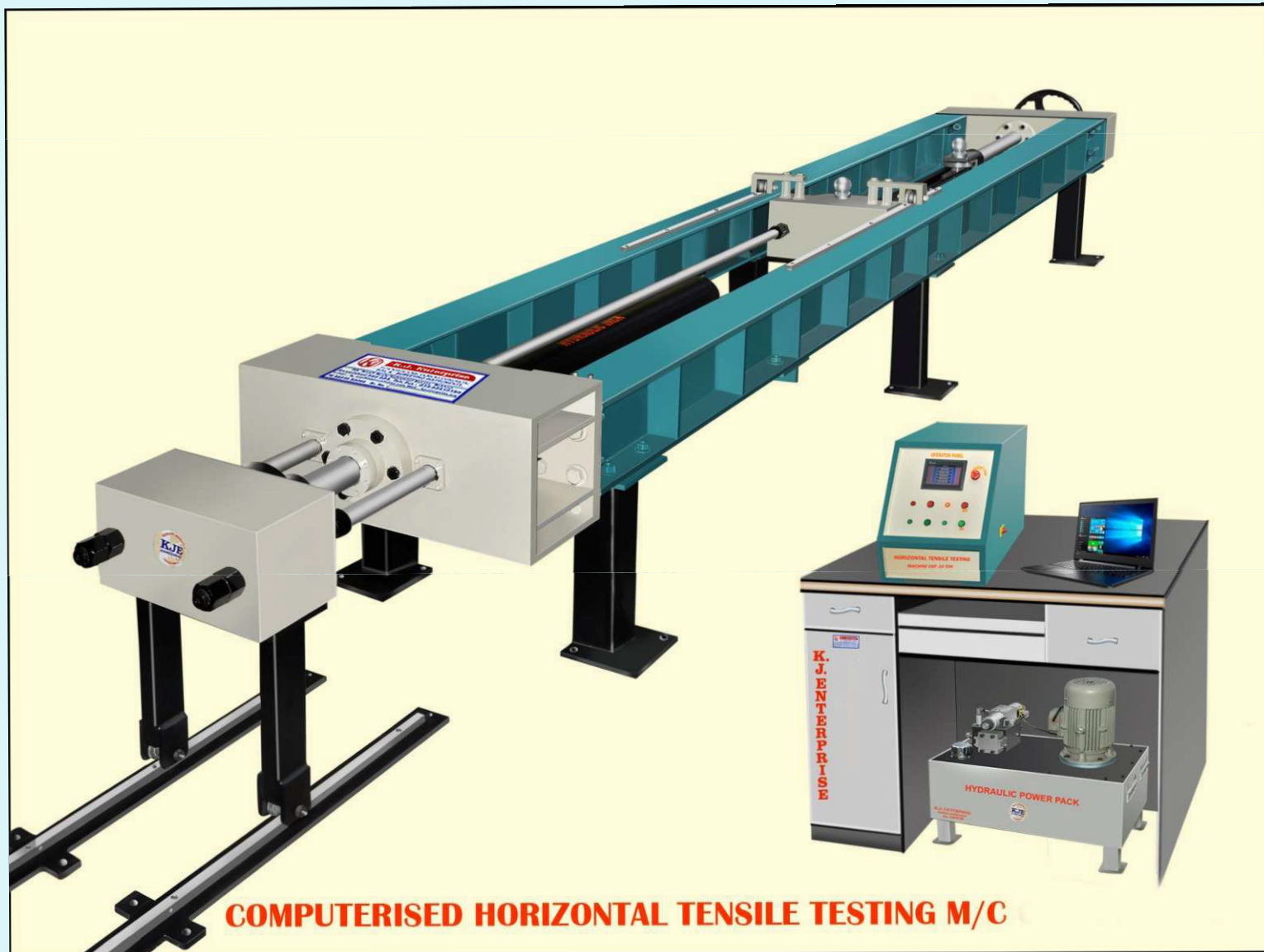
COMPUTERISED HORIZONTAL TENSILE TESTING M/C