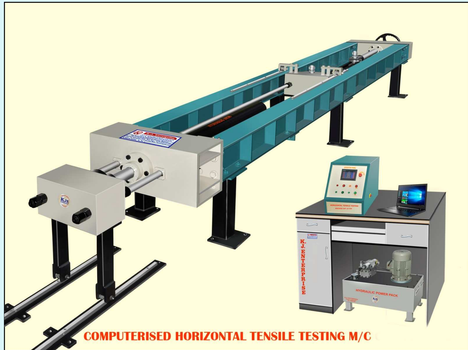
COMPUTERISED HORIZONTAL TENSILE TESTING M/C