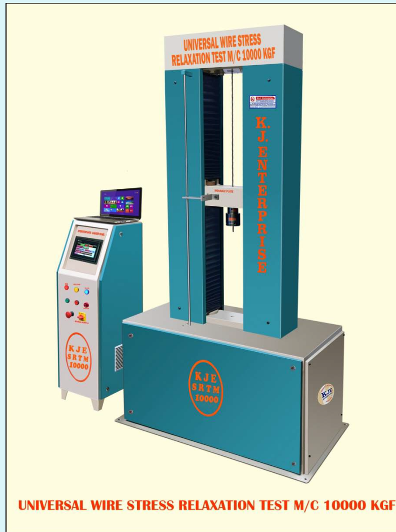
UNIVERSAL WIRE STRESS RELAXATION TEST M/C 10000 KGF